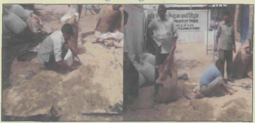
Cheap and balanced concentrate mixture

To evaluate and understand palatability, acceptability, digestibility and effect on production by feeding of Prosopis juliflora pods (upto 25%) containing cheaper concentrate mixture, an experimental feeding trial was initiated on Tharparkar cattle, at Research cum Demonstration Unit, KVK, CAZRI, Jodhpur.