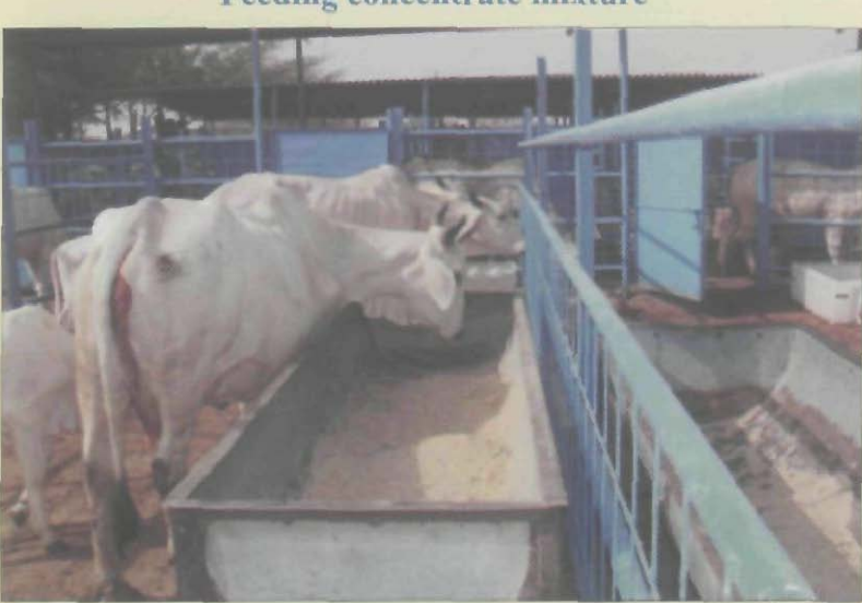
Feeding concentrate mixture

The major observations recorded were monthly body weights, daily concentrate feed intake, blood parameters-haematological and biochemical, daily milk yield with quality analysis at weekly interval for fat and SNF and health check by veterinarian.