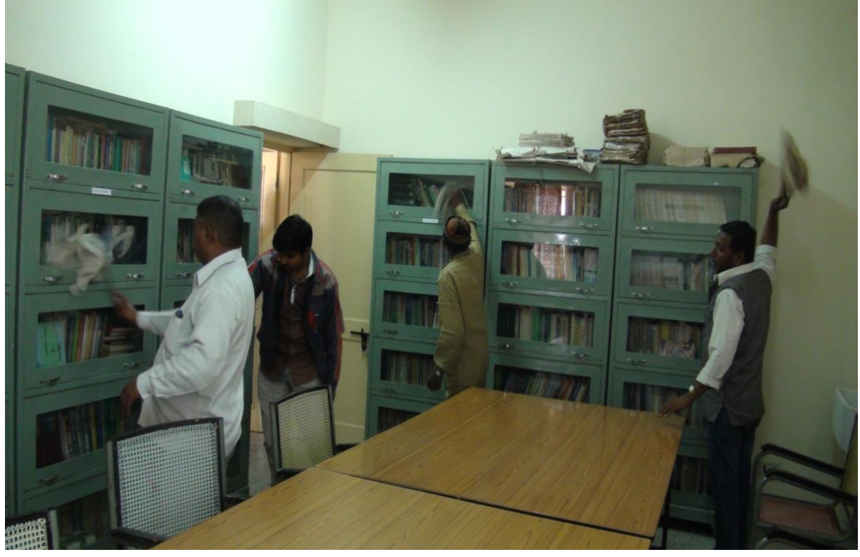
Cleaning committee room and Library