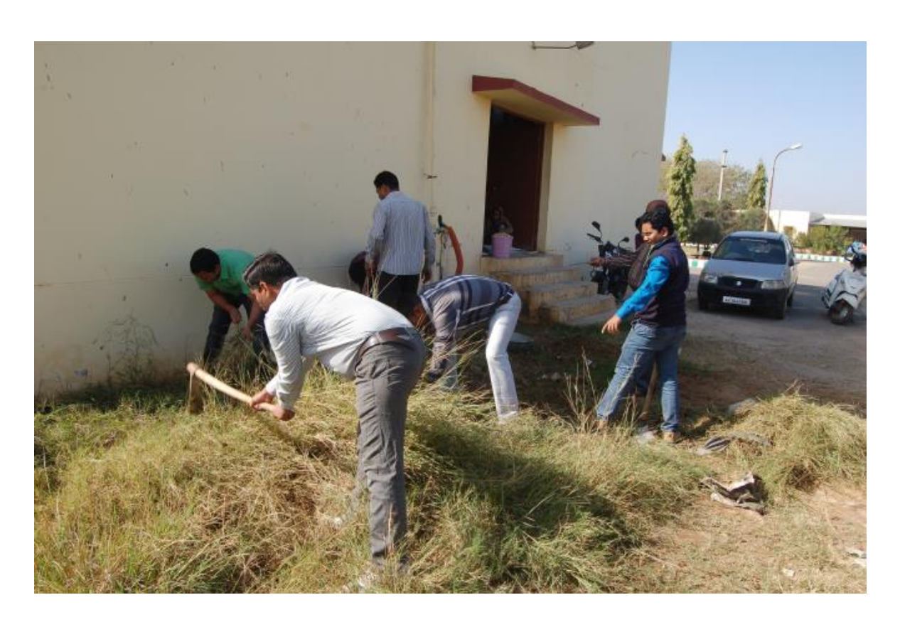
Cleaning of premises by removing weeds